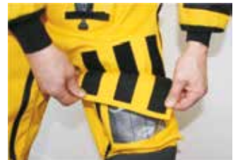
Roomy detachable thigh pockets with room for map/notebook/iPad Mini