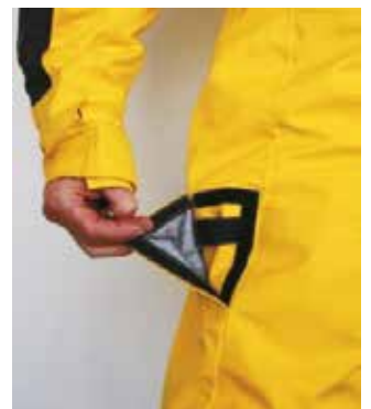
Knife pocket (on opposite side: light pocket for LED Lenser)