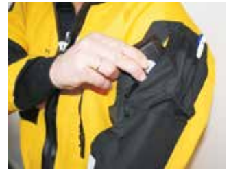
Roomy mobile & pen pocket