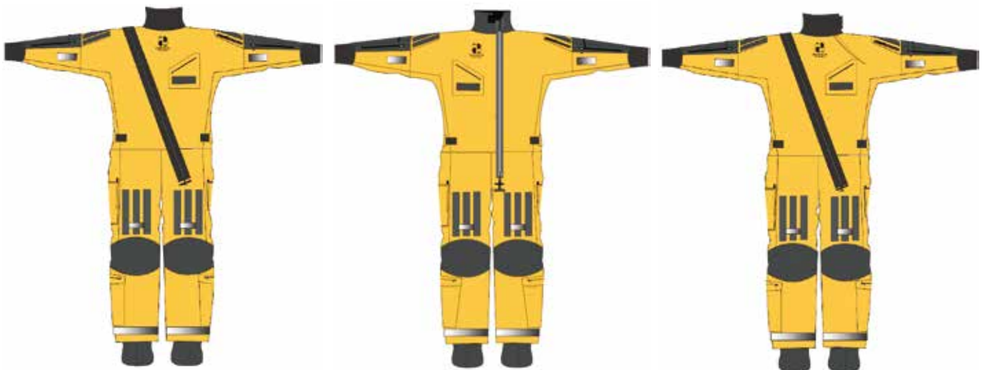
85461 fixed neck seal

As an alternative to the suit with waterproof zip in neck seal, Hansen Protection offers a suit with a innovative neck seal construction and separate waterproof zipper