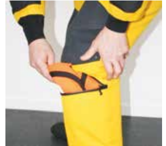
Hood (orange) in leg pocket