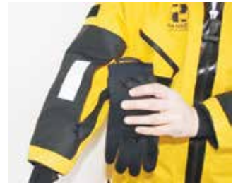
Sleeve pockets with gloves